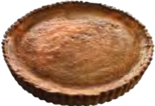
Pumpkin Pie $2.86 per pc : $40.00 each