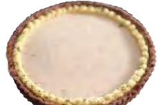
Key Lime Pie $3.00 per pc : $42.00 each