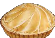
Lemon Meringue Pie $2.78 per pc : $39.00 each