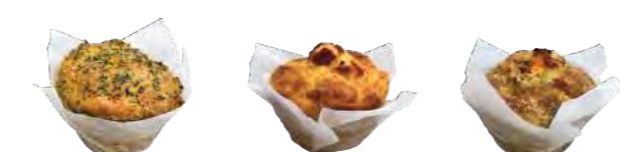
Cheese Onion & Herbs Mediterranean Spinach Feta & Pumpkin