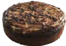
Decadent Choc Banana Cake $3.00 per pc : $42.00 each