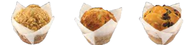
Apple Crumble Banana Honey Blood Orange & Chocolate