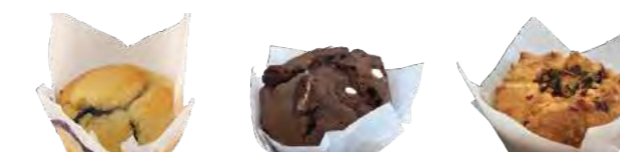
Berry Chocolate Jalapeno Savoury Keto

NB: WRAPPED & LABELLED MUFFINS AVAILABLE - EXTRA $0.25 EACH