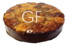
Caramelised Fig & Date Cake $3.00 per pc : $42.00 each