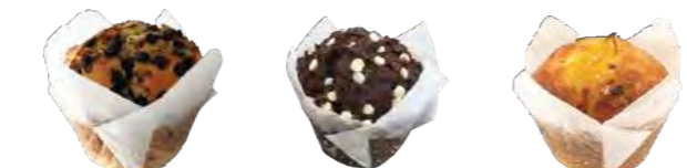
Choc Chip Classic Chocolate Mango & Coconut