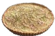
Pina Colada Tart $2.86 per pc : $40.00 each