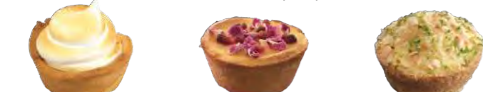
Lemon Meringue Lemon Pomegranate Pina Colada