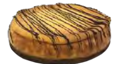
New York Baked Cheesecake $3.00 per pc : $42.00 each