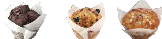
Black Forest Blueberry Raspberry & White Choc