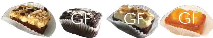
Carrot Chocolate Caramelised Fig & Date Orange & Almond