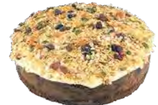
Carrot Cardamom & Honey Cake $2.85 per pc : $39.90 each