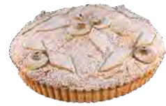
Apple Pie $2.86 per pc : $40.00 each